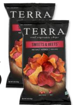
Terra Chips Vegetable Chips selected varieties