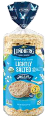
Lundberg Family Farms Organic Rice Cakes selected varieties