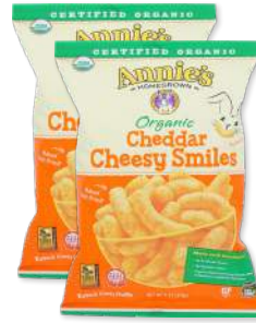
Annie's Organic Cheddar Cheesy Smiles