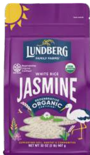
Lundberg Family Farms Organic Rice Pouches selected varieties

Rice-obsessed since 1937. We exist to grow the highest quality rice using organic and regenerative farming practices because the health of our bodies and our planet depend on it.