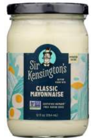
Sir Kensington's Mayonnaise selected varieties