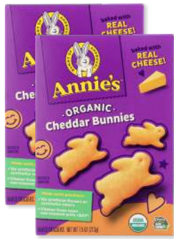
Annie's Organic Bunny Crackers selected varieties

Annie's Promise for Better : a promise to choose nutritious and pantry-worthy ingredients, to add yumminess to every kid's meal, and to use organic ingredients that are forever kind to the planet.