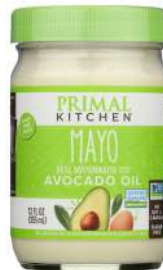
Primal Kitchen Mayo with Avocado Oil selected varieties