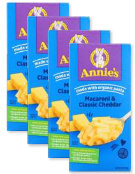
Annie's Mac & Cheese selected varieties