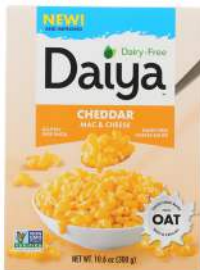
Daiya Deluxe Mac & Cheese selected varieties