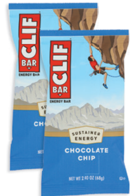
Clif Bar Energy Bar selected varieties