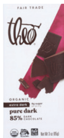
Theo Chocolate Organic Chocolate Bar selected varieties