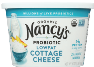
Nancy's Organic Cottage Cheese selected varieties