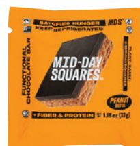
Mid-Day Squares Functional Chocolate Bar selected varieties