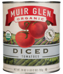
Muir Glen Organic Tomatoes selected varieties