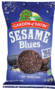
Garden of Eatin' Corn Tortilla Chips selected varieties