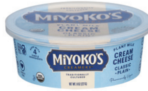
Miyoko's Creamery Organic Vegan Cream Cheese selected varieties

For plant-curious foodies seeking delicious and kinder food choices, Miyoko's Creamery is an organic plant milk creamery that crafts the world's finest vegan cheese & butter, empowering them to choose good food that nurtures good in our world.