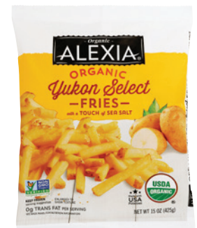
Alexia Organic Fries selected varieties