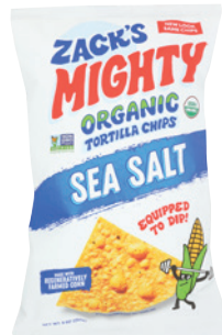
Zack's Mighty Organic Tortilla Chips selected varieties