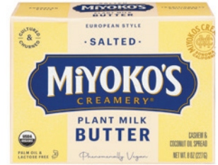
Miyoko's Creamery Organic Vegan Butter