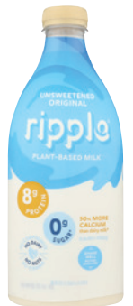
Ripple Plant-Based Milk selected varieties