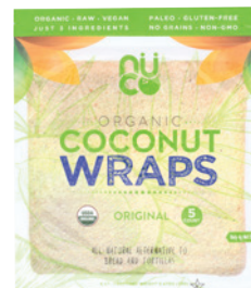
NUCO Organic Coconut Wraps selected varieties