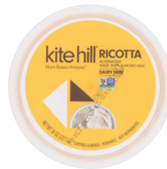
Kite Hill Dairy Free Ricotta