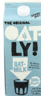
Oatly Oatmilk selected varieties