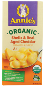
Annie's Organic Mac & Cheese selected varieties