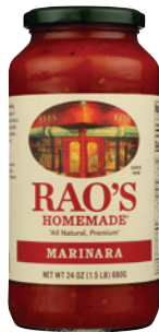
Rao's Pasta Sauce selected varieties