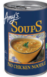
Amy's Soup selected varieties