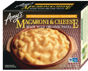
Amy's Macaroni & Cheese

At Amy's, we cook every meal with love. We spend countless hours in our kitchens, so you can enjoy delicious food in minutes. From our scratch made sauces to the perfectly balanced flavors, every bite delivers the comforting taste of home.