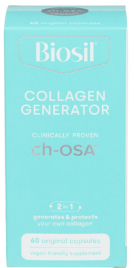
Biosil Collagen Generator