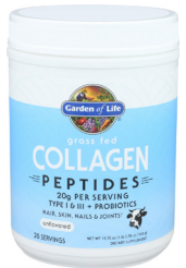
Garden of Life Grass Fed Collagen Peptides