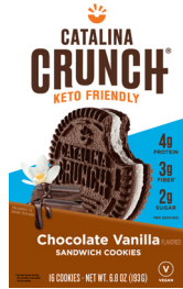
Catalina Crunch Keto Friendly Cereal selected varieties