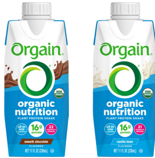
Orgain Organic Vegan Nutritional Shake selected varieties